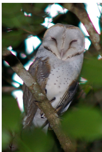
Northern Australian mainland subspecies of the Masked Owl

The subspecies occurring on the north Australian mainland differs from that of the subspecies T. n. melvillensis occurring on the Tiwi Islands, in being lighter (at least for females), and in a series of minor plumage differences (described in Higgins 1999). Both subspecies are appreciably smaller than the two other subspecies from south-eastern and south-western Australia.